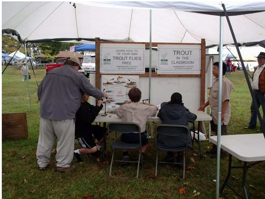
Several kids tying flies with HCTU at the Hammonasset festival last month.

TIC egg distribution took place on November 17 th with 22,000 eggs sent out to all of the schools in the program.