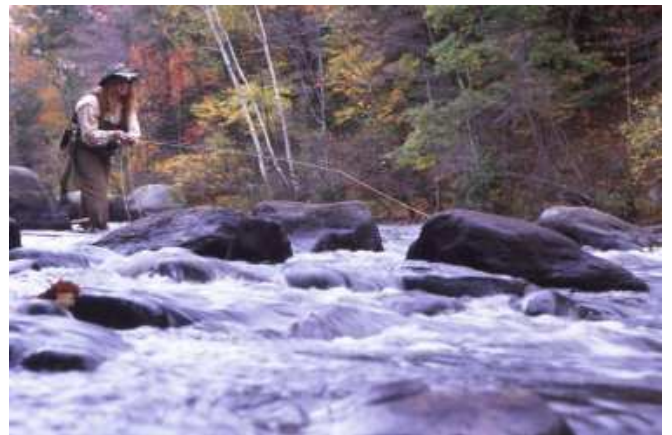
Marla from the cover of “Positive Fly Fishing”

Surface feeding is sipping ripples and will mean that a collection of rusty spinners from size 20-10 will need a look through; the Hendrickson will need a yellow egg bundle and the sulfur spinners (yellow of course) will be the choices.