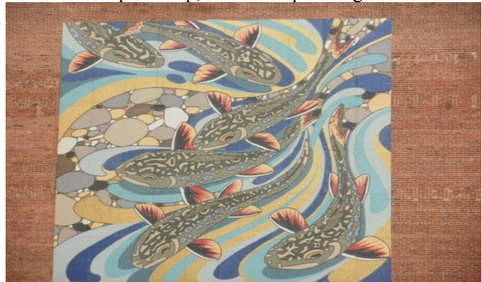
("Cool Waters" Waterbury community Mosaic conceived by Joanne and Bruce Hunter covering 30' x 30')

Fishing is restricted to high water with visibility of at least 2 feet. High water because big survivor trout are forced out of their normally protective home of snags and other inaccessible areas into calmer pools. The displaced fish may also move into the first 100 feet of tributary streams normally too small for such fish. His flies are short palmered streamers with big eyes glued in place. Hooks are 6-4 nymph palmered red and mallard flank. Leaders are 4x and 3x for cloudy skies. Never fish over trout that are paired up, these are spawning fish.