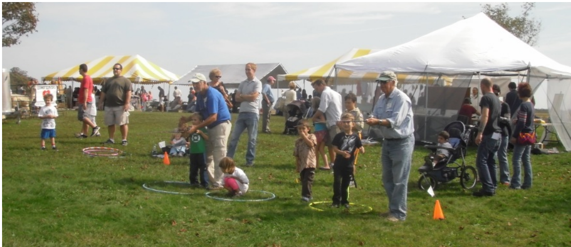
Casting with kids