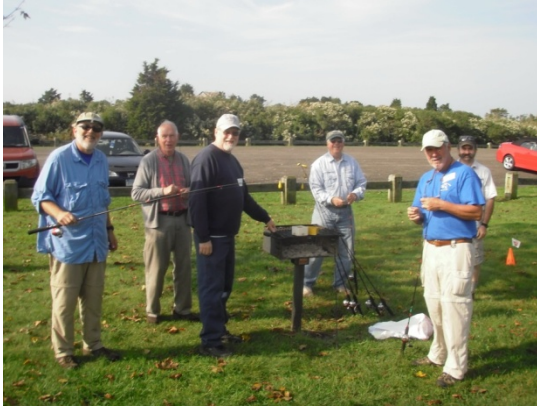
HCTU Casting Crew