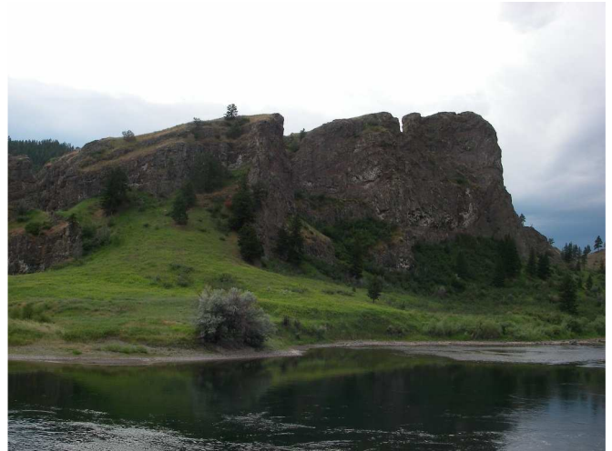
This fishing spot on The Missouri River was perfect place for a postcard photo.