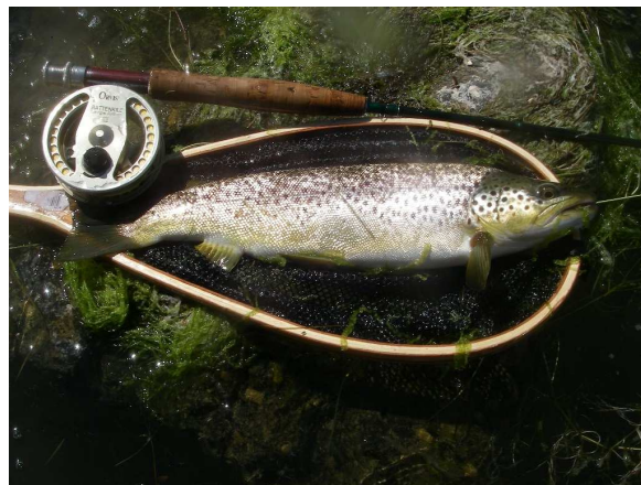
An average 18" Missouri River Brown trout