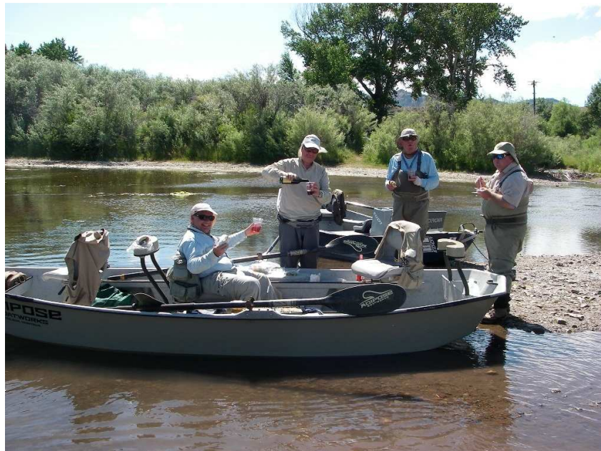
Sharing lunch with friends, and fishing on the Missouri River, what could be better?

Follow Route 17 to junction with CT-68, Turn onto CT-68 West, follow CT-68 (3.5 Miles) Turn LEFT onto N BRANFORD RD. (0.6 Miles) Turn RIGHT into Driveway at 411 North Branford Rd.