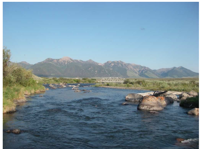
The Madison mountain range near the Three Dollar Bridge.

Notes: Tuck casts are very tough with a fluff bobber because of the wind resistance, substituting a thingamabobber allows further and faster casting. As the user practices using an indicator the more subtle the bites are noticed. The fly needs to be right by the bottom where the fish are. When a bite/strike is noticed, lift the rod to get the hook to move 1/4 inch into the fishes lip. When releasing a fish, grab the fly not the fish.