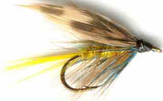
Invicta wet fly

For intermediate sinking line leader overall length of 11.5’ , start with 4’ of the sunset amnesia and droppers set up to give 30” from knot to knot as above with the floating line.