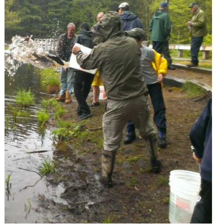
Stocking fish at the YED