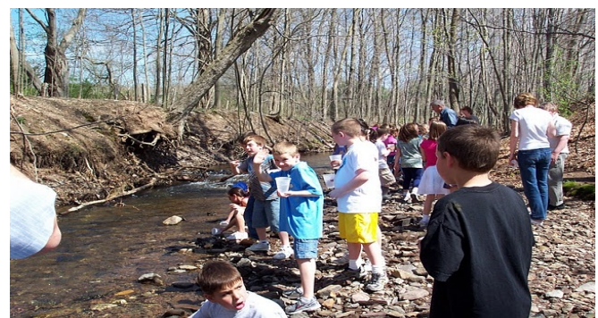
(Korn school fish release)