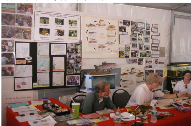
The display will highlight Trout In the Classroom as this photo taken from the Durham fair.