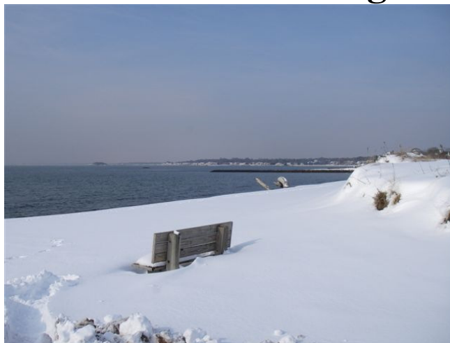
A bench at Hammonasset State Park, waiting for winter to leave.

With all this snow on the ground and ice on the streams, now is the perfect time to go to the fishing shows, expos and banquets to get the flies and gear and you need for the upcoming season. It may still seem like the middle of winter, but in just a few weeks the Trout Management Areas (TMA's) will be stocked with trout. The weather won't holdup the stocking very long because the DEP only has a short window in the spring to stock all the rivers. The DEP cannot delay this task because they need to get the fish in the water before Opening Day and to make room in the hatchery to produce next year's fish. The TMA's are open for fishing year round, but most are restricted to catch and release until opening day in April.