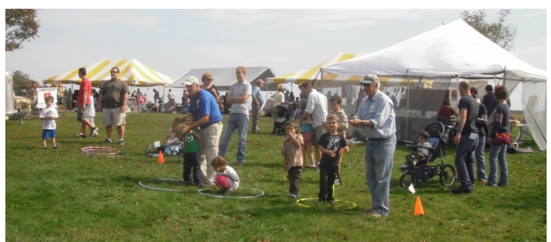
Casting with kids