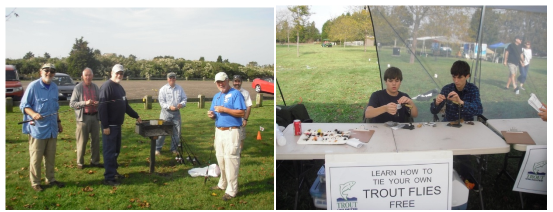
HCTU Casting Crew